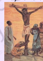
The crucifixion Jesus Mafa