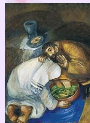
The washing of Feet Sieger Koder