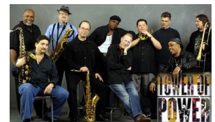
Tower of Power