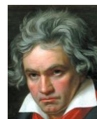
Ludvig Van Beethoven