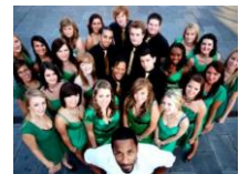
ACM Gospel Choir