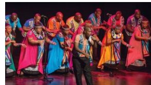
Soweto Gospel Choir