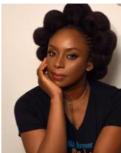
Chimamanda Ngozi Adichie