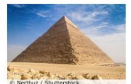
The Great Pyramid of King Khufu (Cheops) at Giza

What were some achievements of the Ancient Egyptians, and how do they compare to other societies? The Ancient Egyptians achieved many things, like building the pyramids, inventing writing, and creating a calendar. Some might say the pyramids are their greatest achievement because they are so impressive. Compared to other societies, like the Greeks or Romans, the Egyptians' architecture stands out.