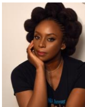
Chimamanda Ngozi Adichie