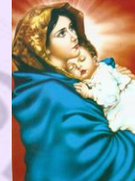
Mary, The Mother of Jesus