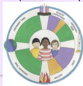
The Liturgical Year