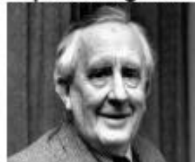
J.R.R. Tolkien (1892 – 1973)

The famous author of Lord of the Rings and The Hobbit was a language lover, and is known for including several amazingly-detailed made-up languages in his books.