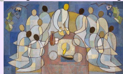
The last supper. Soichi Watanabe