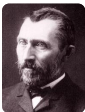
Vincent Van Gogh