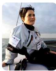
Dame Ellen MacArthur