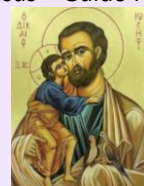
Joseph and Jesus Icon