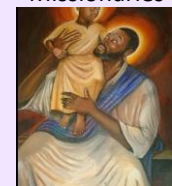
Joseph and Jesus