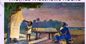
Holy Family – Mill Hill Missionaries