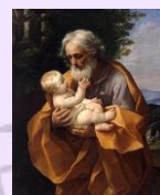
St Joseph with the infant Jesus – Guido Reni