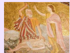
Abraham and Isaac Icon