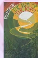
Prepare the way of the Lord Sisters of Turvey Abbey