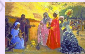
Magi Jesus Mafa