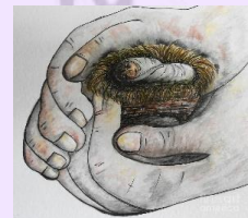
God's Greatest Gift Eloise Schneider