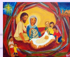
Nativity Hannah Arghese (Malaysia)