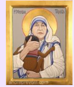
St Mother Theresa