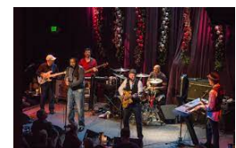
The Average White Band