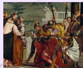
Jesus and the Centurion Paolo Veronese