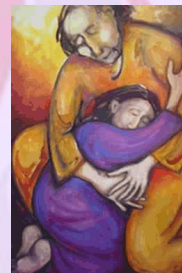
Back in God's Embrace Vocation Network