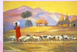
Jesus as Good Shepherd Jesus Mafa