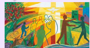
Sacrament of Reconciliation Turvey abbey