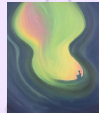
The soul is like a cavern E Wang