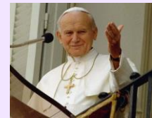
Pope St John Paul II