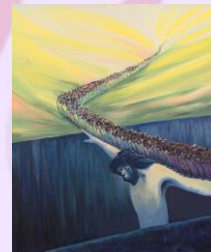
Christ is the bridge to heaven E Wang