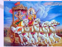
Krishna and Arjun