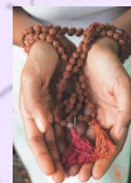
Hindu prayer beads