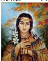
St. Kateri Tekakwitha