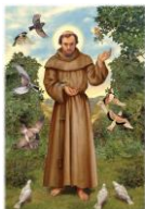
St Francis of Assisi