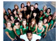
ACM Gospel Choir