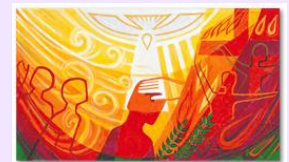
Confirmation Turvey Abbey