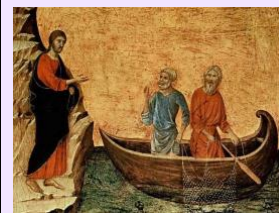
The call of the disciples icon