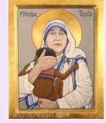
St Mother Theresa