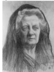
Jane Ellen Harrison (1850 - 1928)

A British classical scholar and linguist. She has also been credited with being the first woman to obtain a post in England as a 'career academic'.