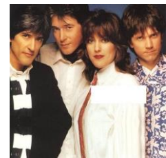
Katrina and the Waves