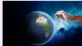
God the Creator