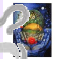
Schöpfung Gregor Koda