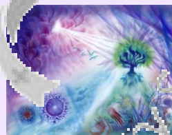
Psalm 8 Moshe Zvi Berger