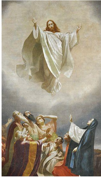
Gebhard Fugel, 1893/1894